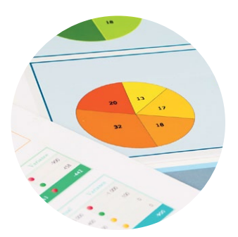
Figure 4: Different tax base options for beverages

The responsiveness of consumers to price changes (price elasticity) for the food and beverage products that may be taxed is central in the design of taxes for health promotion. When consumers can substitute alternative products, their response to price increases will be greater; but not all substitutions are likely to be desirable. Carefully designing the tax base (range of products to be taxed) will help to prevent undesirable substitutions, and possibly steer substitutions towards healthy alternatives (Figure 4).